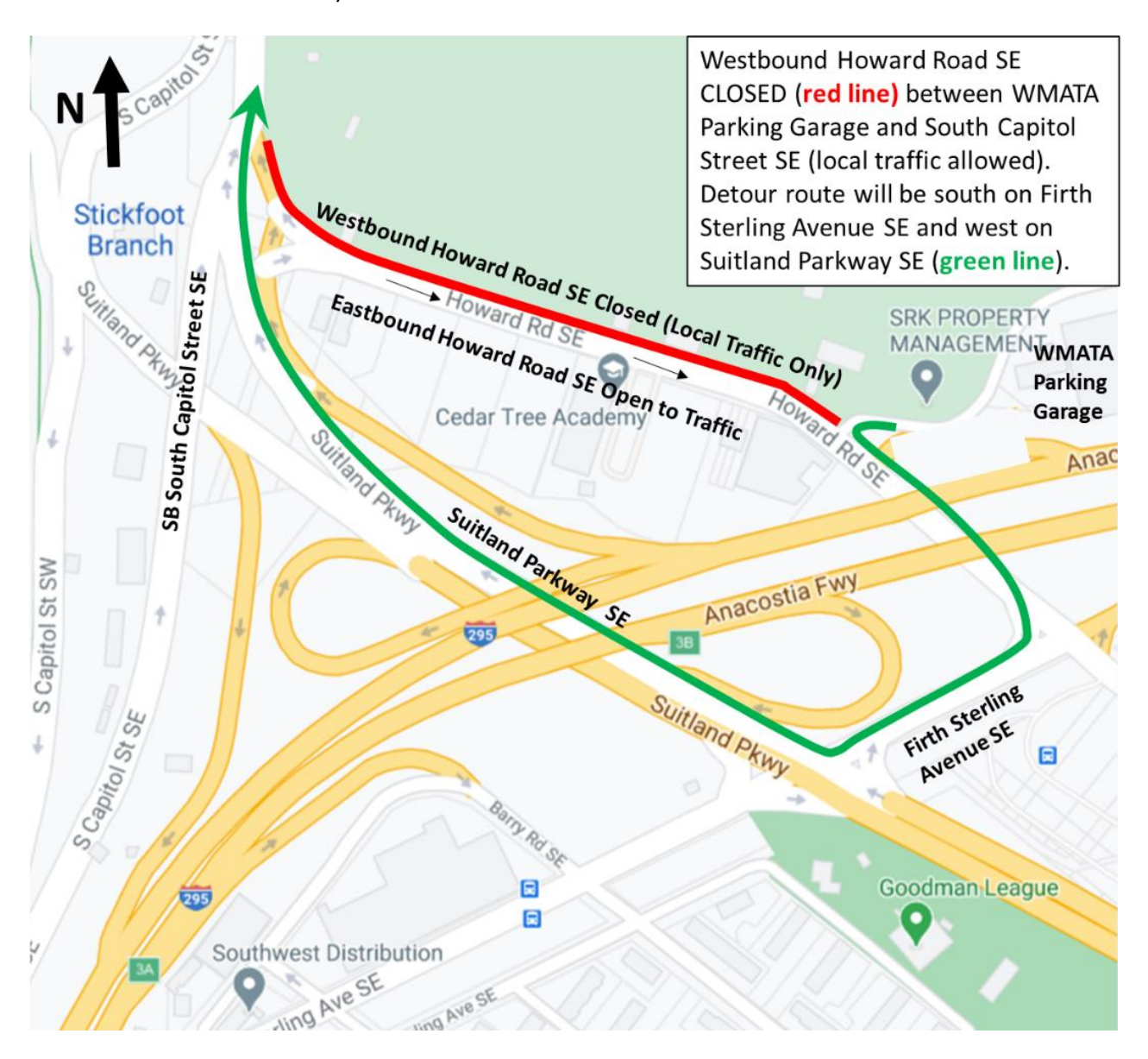
Daytime Westbound Howard Road SE Closure & Detour

On Thursday, February 25, 2021 , this segment of Howard Road will also be closed in the westbound direction only between 10:00 a.m. and 5:00 p.m. For these closures, pedestrian and cyclist access to Anacostia Metrorail Station remains unchanged. However, pedestrians and cyclists are advised to stay alert and follow signage when traveling through this area as well as the surrounding construction areas.