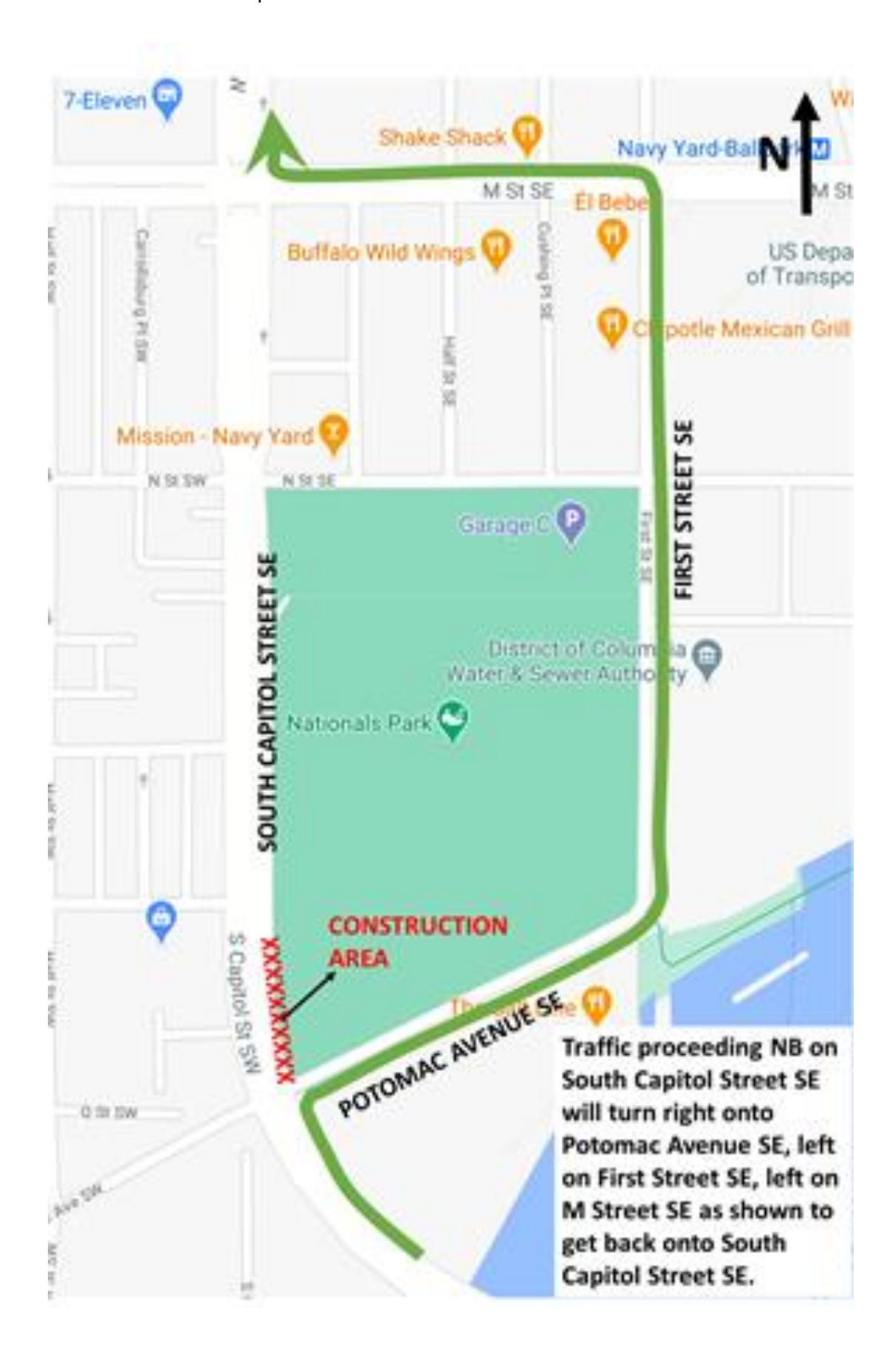
NB South Capitol Street SE Closure & Detour at Potomac Avenue SE

Northbound South Capitol Street SE between Potomac Avenue SE and P Street SE will be closed from 5:00 a.m. on Saturday, February 27 to 8:00 p.m. on Sunday, February 28, 2021 as shown in the graphic. A marked detour will be in place during this closure.